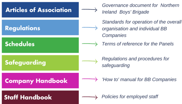
Fig 2: Governance within The Northern Ireland Boys' Brigade.